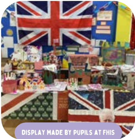
DISPLAY MADE BY PUPILS AT FHIS