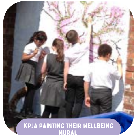
KPJA PAINTING THEIR WELLBEING MURAL