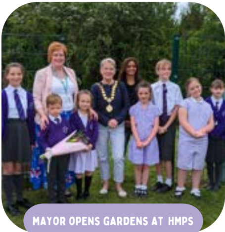
MAYOR OPENS GARDENS AT HMPS