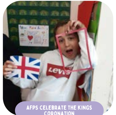
AFPS CELEBRATE THE KINGS CORONATION