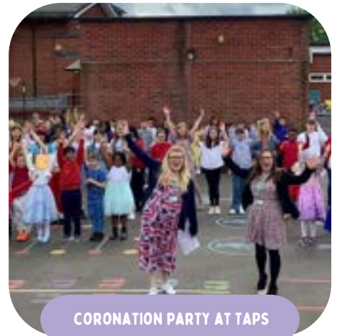
CORONATION PARTY AT TAPS