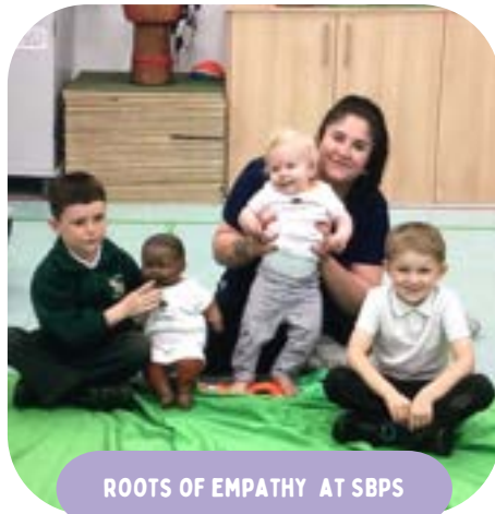
ROOTS OF EMPATHY AT SBPS