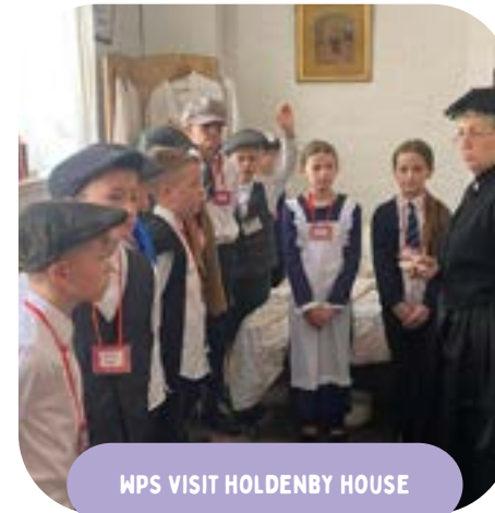
MPS VISIT HOLDENBY HOUSE