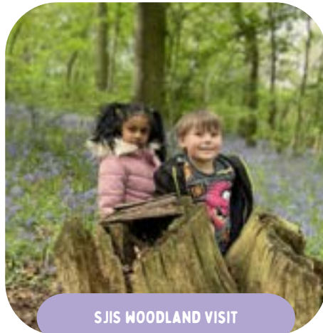
SJIS WOODLAND VISIT