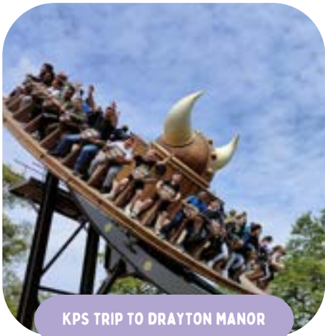
KPS TRIP TO DRAYTON MANOR