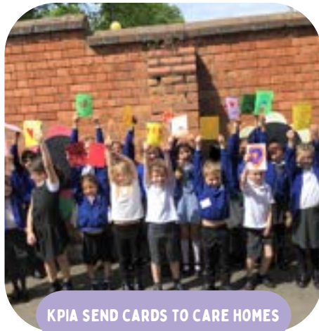
KPIA SEND CARDS TO CARE HOMES